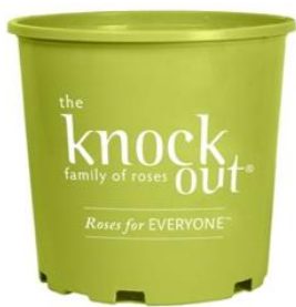
The Knock Out® Family of Roses® mandatory container