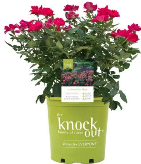
Compliant use of Knock Out® Roses mandatory container and tag