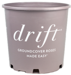
Drift® Roses mandatory container