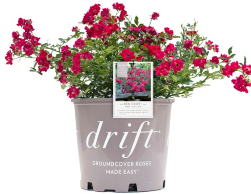
Compliant use of Drift® Roses mandatory container and tag

(Red Drift® variety shown as an example)